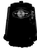
Earth Machine™ Compost Bin 80 gallon capacity

Erie County, the City of Buffalo, and the Western NY Stormwater Coalition are selling rain barrels, compost bins and accessories.